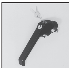
SCE-PKH5 SCE-PKH7 Key: SCE-KC101