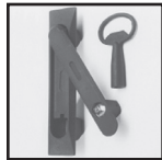
SCE-FSH4 Key: SCE-101697