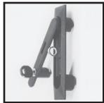
SCE-FSH6 Key: SCE-K333