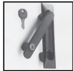
SCE-FSH2 Key: SCE-K333