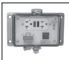
Network Tap PC Board with 120 VAC Duplex GFCI with internal Simplex GFCI & 3 Amp circuit breaker