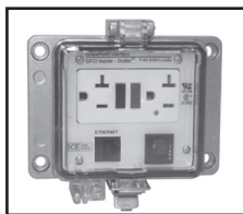
RJ-45 CAT5 F/F connector with 120 VAC Duplex GFCI with internal Simplex GFCI & 3 Amp circuit breaker