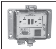
DB9 M/F connector with 120 VAC Duplex GFCI with internal Simplex GFCI & 3 Amp circuit breaker