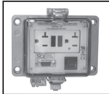
DB9 F/M connector with 120 VAC Duplex GFCI with internal Simplex GFCI & 3 Amp circuit breaker