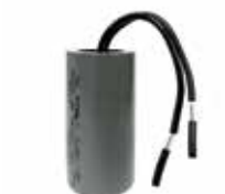
Metal Can-Type Capacitor