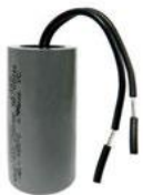
Metal Can-Type Capacitor