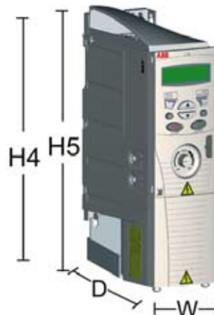
Wall Mounted Drives (NEMA 1) with MUL1-R1 option