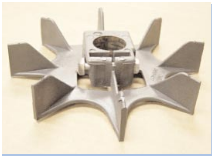
Radial Fan (Bi-Directional)

The propeller and sirocco types are dependent on direction of rotation to produce airflow over the motor for cooling (unidirectional). These fans are used on larger and/or higher speed motors to reduce the air noise and provide more efficient cooling. To change the direction of rotation of a motor equipped with a propeller type requires a different fan having the blade angle reversed. These fans are available from Emerson Motor Company for retrofit.